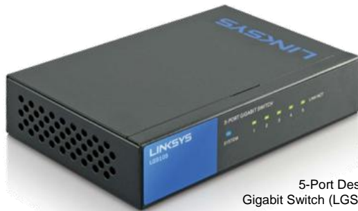
5-Port Desktop Gigabit Switch (LGS105)