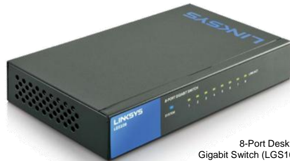
8-Port Desktop Gigabit Switch (LGS108)